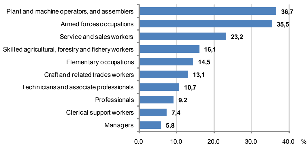
Shares of persons who at least sometimes worked at night by major group of the CZ-ISCO in 2012

Within the sample survey every sixth respondent (of almost 780 thous. persons after grossing-up) stated that they at least sometimes worked at night from 23 to 6 o'clock within the reference period. On the contrary to work in the evening employees work at this time more frequently (over 18%) than entrepreneurs with employees (6%), or own account workers (less than 8%). Intensity of work at night of employees follows, first of all, from the way the shift work regime is applied in respective occupations. Almost 37% of all persons working as plant and machine operators, and assemblers (a quarter of million when grossed up to the whole population) and also almost one fourth of persons working in services and whole and retail sale work, at least sometimes, at night. Employees in the armed forces also work in the evening quite often yet they represent the smallest of all major groups of occupations of the CZ-ISCO.