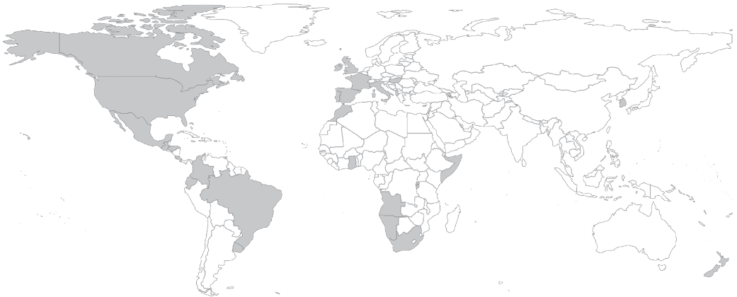
Picture 3 Map of countries publishing SUF and PUF

Here are presented countries that publish census microdata not only for scientific purpose (SUF) but also for public (PUF). Countries that were categorized in this cluster are listed in Table 16 to Table 20 and are categorized geographically by continent. Picture 3 shows on a world map the countries that publish SUF and PUF microdata. A full size map can be downloaded from the author's GitHub. 9 Picture 3 shows on a world map the countries that publish PUF microdata.