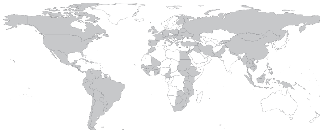
Picture 1 Map of member states of IPUMS

Table 30, which was placed in the Annex due to its size, then shows the complete range of microdata available to IPUMS library 3 on 1/3/2022. Picture 1 shows on a world map the countries that are represented in their database. The full-size map can be downloaded from the author's GitHub. 4 The differences between the table and the map are the countries Iceland, Norway, Sweden and Denmark, because these countries provide only historical values from the years before 1960.