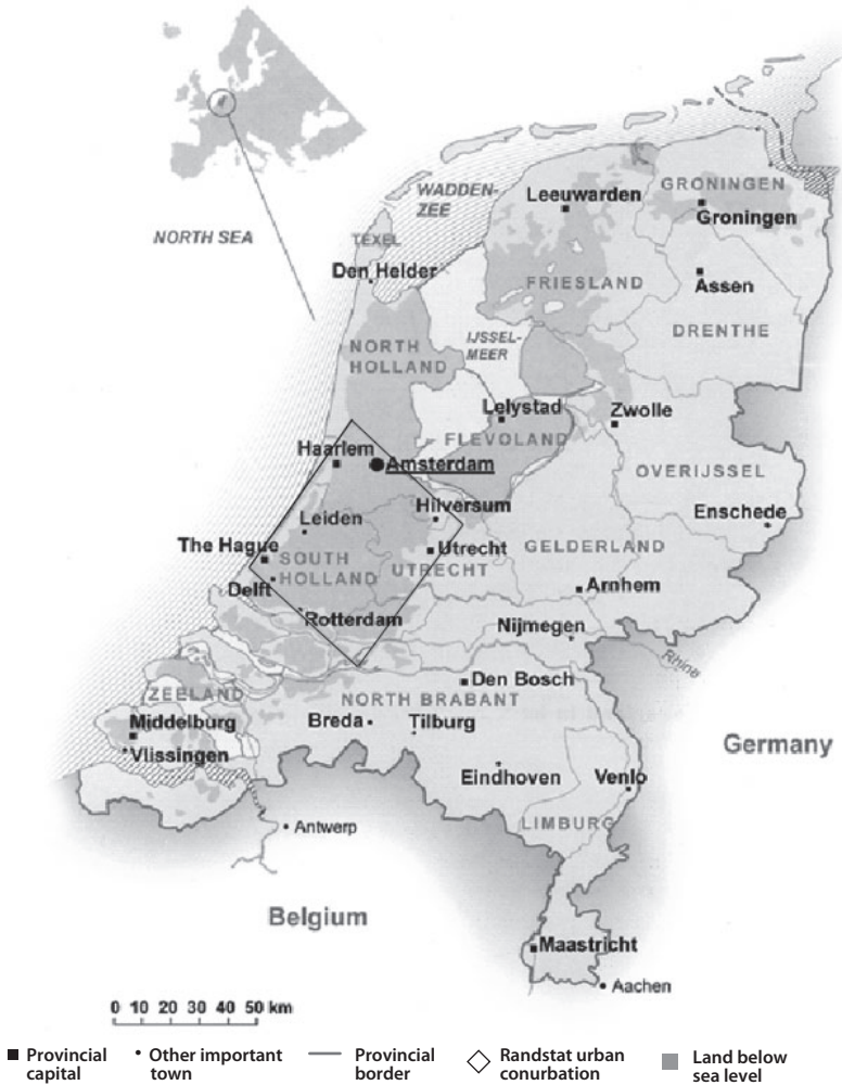
Figure 1 The Kingdom of the Netherlands in Europe

lands: not all variables relevant for the census can be found in registers. They are therefore very interested in the Dutch approach of combining registers and existing sample surveys and using modern statistical techniques and accompanying software to compile the hypercubes. Obviously, it is essential that statistical bureaus are permitted to make use of registers that are relevant for the census. For Statistics Netherlands this is laid down in the statistical law that came into force in 2004. Nevertheless, Statistics Netherlands will have to maintain the good contact it has established with register holders over the last 25 years. Timely deliveries with relevant variables for Statistics Netherlands are crucial for official statistics production.